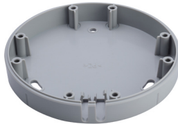
Plate with threaded screw holes for ceiling mounting