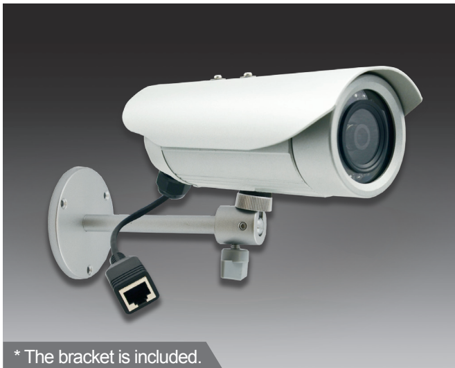
* The bracket is included.