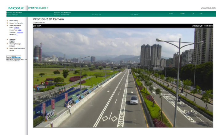
Step 5: Access the VPort's system configuration.

Click on System Configuration to access the overview of the system configuration to change the configuration. Model Name , Server Name , IP Address , MAC Address , and Firmware Version appear on the green bar near the top of the page. Use this information to check the system information and installation.