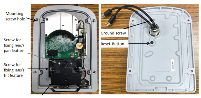
Calibration for tuning lens's vertical (-5 to 10^{\circ} )and horizontal (+/- 5^{\circ} ) position