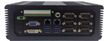
3I390AW / 3I385AW Back Panel