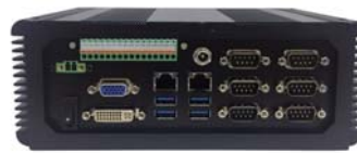
31610CW / 31390AW Back Panel