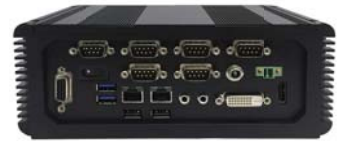
31847AW Back Panel