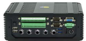
31610NX(M12) Back Panel