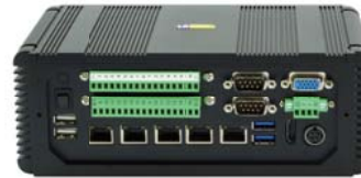
31610NX(RJ45) Back Panel