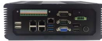
3I390NX / 3I393NX Back Panel

▶ Application : Automation / Surveillance / POS, Kiosk / Digital Signage / Networking