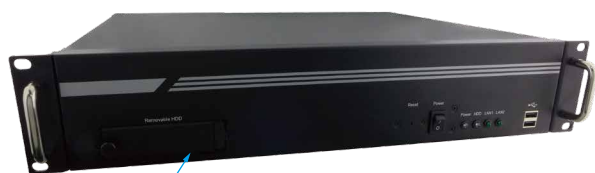
2 x Removable 2.5" Drive Bay